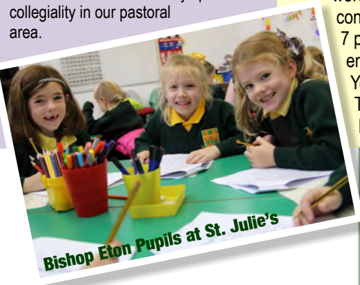
Bishop Eton Pupils at St. Julie's

Looking back on the summer, students performed exceptionally well in their exams. In year 11, 92% of students achieved A*-C in a Language of their choice, an incredible achievement even for a Specialist Language College. The Government benchmark for schools is now a minimum of 5 A*-C GCSE with English and Maths, and 7 out of every 10 girls exceeded this expectation. We received special praise from the Principal Officer for Education for our "contribution to the success of Liverpool's young people" by "ensuring that our 'school has exceeded the top quartile forecast'". No surprise then that our intake into Sixth Form rose by nearly 40%. As this newsletter goes to print we welcome 300 pupils from Years 1-5 in Bishop Eton for two weeks. We were very sorry to hear of the disruption caused by the recent fire and have successfully accommodated all the pupils at our school. We have very much enjoyed having the children and the experience has served to strengthen and broaden the community spirit and collegiality in our pastoral area.