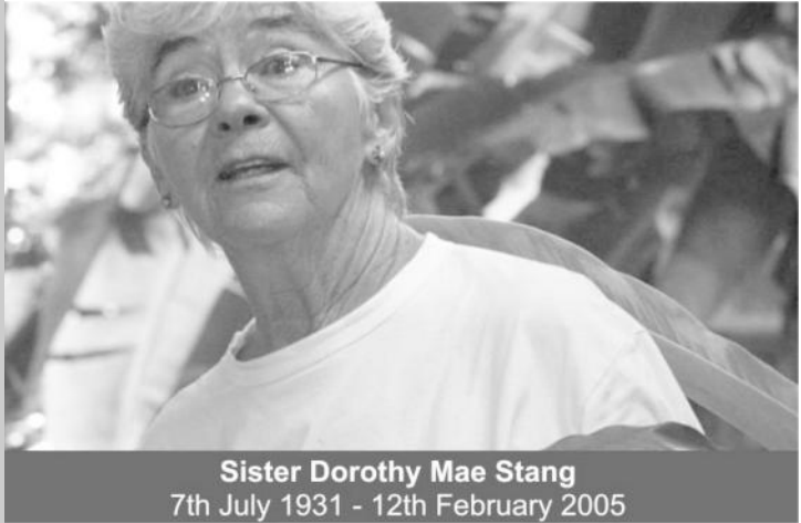
Sister Dorothy Mae Stang 7th July 1931 - 12th February 2005

12th February is a very special day in the life of all Notre Dame schools and, of course, we are so lucky to be the only Notre Dame school named after the foundress, St. Julie Billiart. It's special because it's the day we remember Sister Dorothy Stang, SND, who, ten years ago, was murdered because of her campaigning against those who exploit the disadvantaged and who seek to gain wealth at the expense of the biodiversity of the Amazon rainforest.