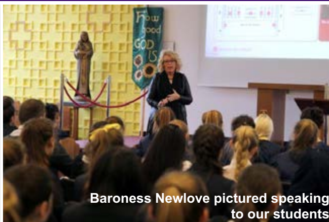
Baroness Newlove pictured speaking to our students